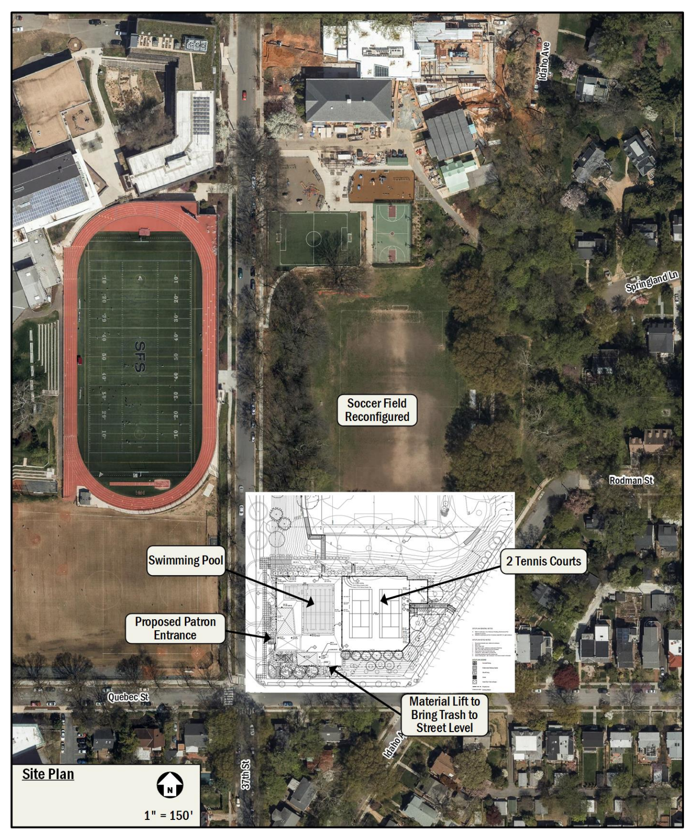
Figure 1: Site Location and Site Plan